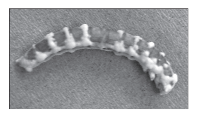
Fig. 3. Emergence of B. bassiana (isolate BEH) from dead larvae of T. molitor